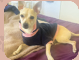
Sparky, Douglas Glen

To have your pet featured, email news@mycalgary.com