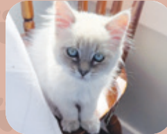
Ash, Mckenzie Towne