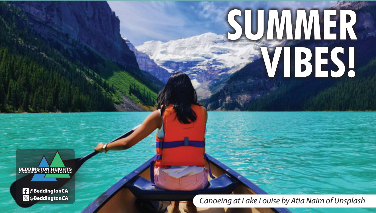
Canoeing at Lake Louise

BEDDINGTON HEIGHTS COMMUNITY ASSOCIATION