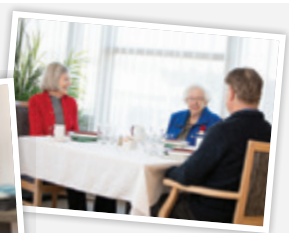
Daily dining in the company of new friends

Availability for certain floor plans is becoming limited. Don't miss out! Call now for the best selection of private suites.