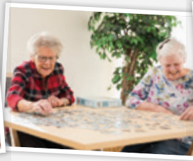
Enjoy an active social life