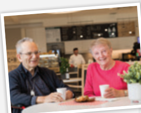
Treat yourself at the Bistro