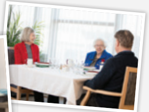
Daily dining in the company of new friends

Availability for certain floor plans is becoming limited. Don't miss out! Call now for the best selection of private suites.