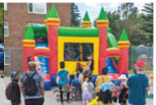
Food trucks and bouncy castle, Bouncy castle 8 in and 8 lined up