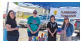
St Lukes is raising money to build a new playground; they had all sorts of treats