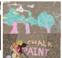
Chalk paint – out before 10:00 am, Chalk paint art