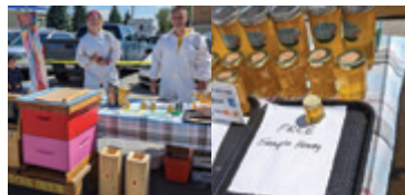
Brentwood's beekeeper Brisebois Bees brought a hive (did you find the queen), honey for sale, and free seed packs and honey samples