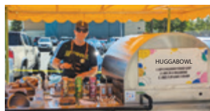
No Fixed Address YYC