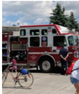
Fire truck makes a brief appearance