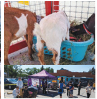
Goats having a snack, Checking out the bees, and Telus brought new games