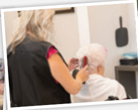
Pamper yourself at the salon