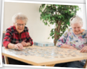
Enjoy an active social life