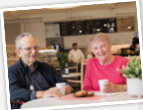
Treat yourself at the Bistro