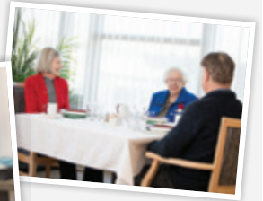
Daily dining in the company of new friends

Availability for certain floor plans is becoming limited. Don't miss out! Call now for the best selection of private suites.