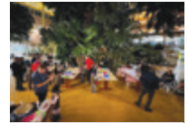
Beavers building origami decorations with residents at Bethany.

It's been a busy year for the 4th Elks Triwood Beavers and Cubs. This winter, Cubs and Beavers visited the Fire Department, built decorations with residents at Bethany, and undertook a snowshoe adventure in Confederation Park. Cubs had camp outs at AHEIA camp Alford to try snow shoeing, archery, ice fishing, and more, while the Beavers did a sleep over at the 18th Scout Hall in Bankview. The Beavers and Cubs are looking forward to some more hikes in the spring, canoeing, and going to horseback riding camp at the end of May.