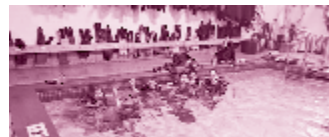
Cubs having a go at scuba diving at the Dive Shop.

We need leaders to make these programs happen. If you are new to scouting or want to get back into Scouting and are interested in building your outdoor skills along with your youth, there is a place for you at 4th Elks. Contact us at 4thElksTriwood@gmail.com .