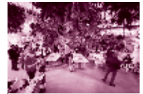
Beavers building origami decorations with residents at Bethany.

It's been a busy year for the 4th Elks Triwood Beavers and Cubs. This winter, Cubs and Beavers visited the Fire Department, built decorations with residents at Bethany, and undertook a snowshoe adventure in Confederation Park. Cubs had camp outs at AHEIA camp Alford to try snow shoeing, archery, ice fishing, and more, while the Beavers did a sleep over at the 18th Scout Hall in Bankview. The Beavers and Cubs are looking forward to some more hikes in the spring, canoeing, and going to horseback riding camp at the end of May.