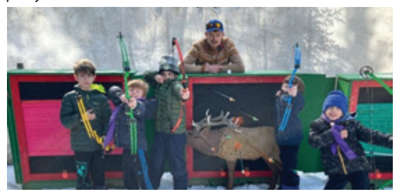
Cubs learning archery skills at the winter camp at AHEIA's Alford Lake camp.