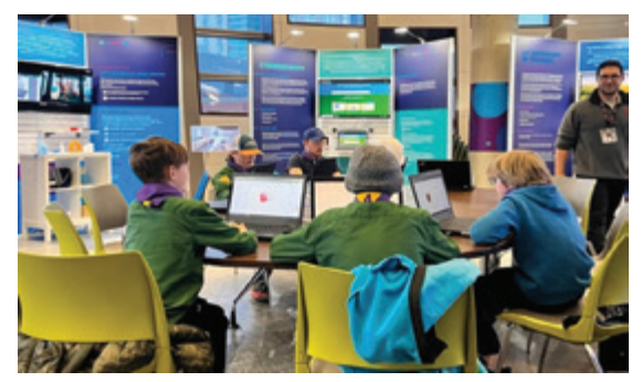
The Scouts at SAIT's 3D print lab.

If you're interested in registering your youth or learning more about our group, feel free to email, check out our Facebook page, or see our website for details.