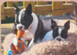
Thor and Loki, Shawnessy