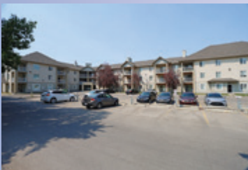
103, 3000 Citadel Meadow Pt NW

Renovated 4 Bdrms, 6-Car Garage $2,690,000