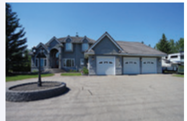
8 Villosa Ridge Point

4 Bdrms, West Yard, Fully Finished $1,149,900