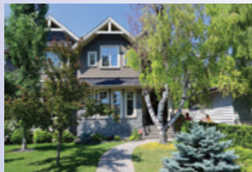
3015 - 28 Street SW

4 Bdrms, West Yard, Fully Finished $1,149,900