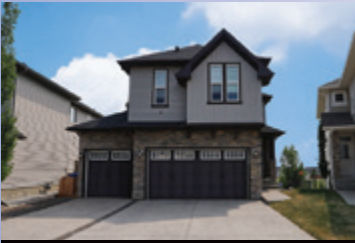
31 Sage Bank Place NW

Sell your home quickly for asking price, possibly above!!