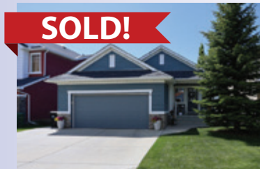
91 Evanspark Terrace NW

Fully Finished, 4 Bdrms, on Ravine $1,189,900