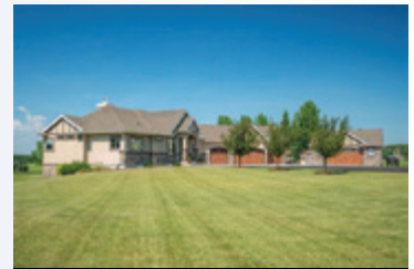
240 Brown Bear Point

Mint 3 Bdrms, Backs South on Park $779,900