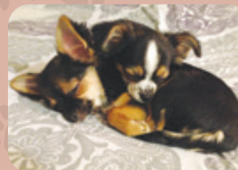
Tiger and Lily, Evanston

To have your pet featured, email news@mycalgary.com