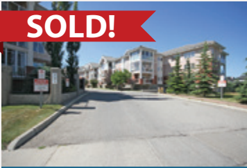
206, 223 Tuscany Springs Bv NW 1 Bdrm + Den, Mountain Views $629,900