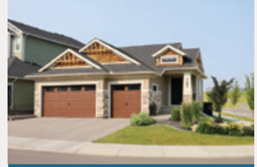
107 Crestridge Hill SW Upgraded 3 Bdrm Bung, on Ravine $1,199,900