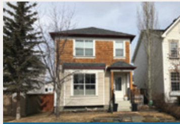
44 Tuscany Springs Circle NW Renovated 4 Bdrm, Fully Finished $749,900