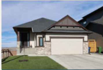
48 Saltsage Heath 4 Bdrms, Finished Walkout on Park $1,399,900