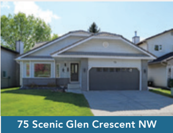
5 Bdrms, Walkout on Ravine $789,900