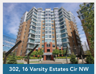
2 Bdrm + Sunroom, Corner Unit $499,900