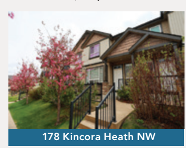
3 Bdrm Townhome, 2 Car Garage $465,000