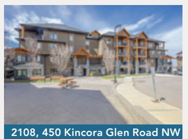
2 Bdrms, Pinnacle at Kincora $524,900