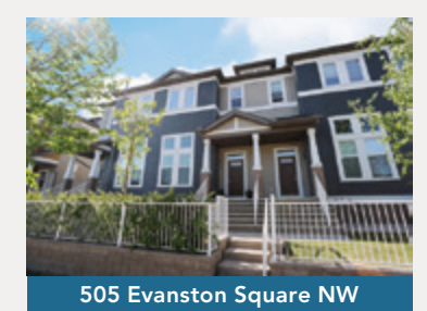
Upgraded 2 Bdrm Townhome $469,900

3D tours, detailed floor plans, plus much more with our proven marketing and state-of-the-art technology. Call for your <u>free home evaluation</u> today!