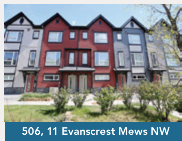
Upgraded 2 Bdrm, Faces Park $449,900