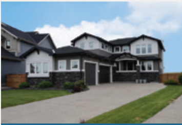
39 Prairie Smoke Rise, Harmony 5 Bdrms + Den, 3 Car Garage $1,695,800