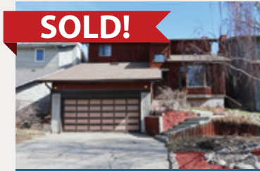
24 Hawwood Crescent NW 3 Bdrms + Den, Steps to Park $599,900