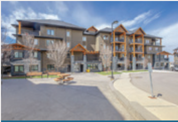
2108, 450 Kincora Glen Road NW 2 Bdrms, Pinnacle at Kincora $539,800

Contact Us Today and Let Our Experience Work for You!