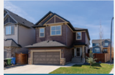
170 Sage Bluff Close NW 4 Bdrms + Bonus, West Backyard $849,900