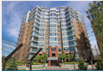
302, 16 Varsity Estates Cir NW 2 Bdrms + Sunroom, Corner Unit $499,900