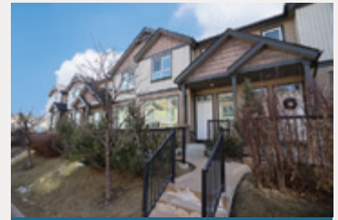
178 Kincora Heath NW 3 Bdrm Townhome, 2 Car Garage $485,000

3D tours, detailed floor plans, plus much more with our proven marketing and state-of-the-art technology. Call for your free home evaluation today!