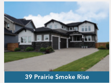
5 Bdrms + Den, 3 Car Garage $1,719,900