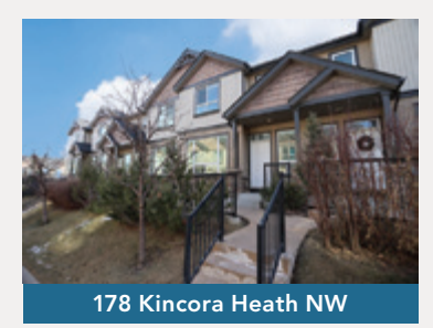
3 Bdrm Townhome, 2 Car Garage $504,900

3D tours, detailed floor plans, plus much more with our proven marketing and state-of-the-art technology. Call for your <u>free home evaluation</u> today!