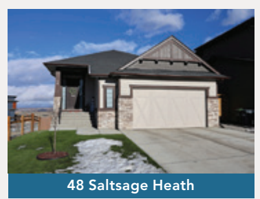
4 Bdrms, Finished Walkout on Park $1,399,900