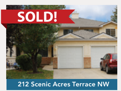
Updated 3 Bdrm Townhome $539,900