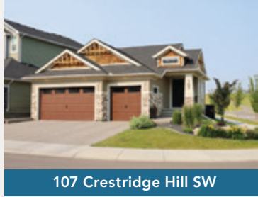
Upgraded 3 Bdrm Bung, on Ravine $1,199,900