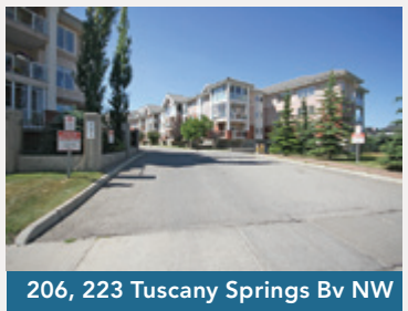
1 Bdrm + Den, Mountain Views $629,900