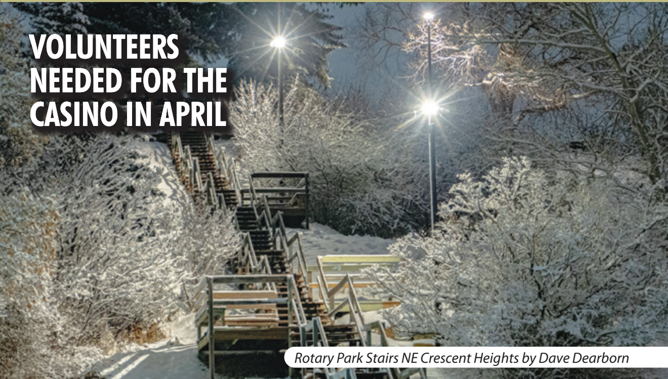
Rotary Park Stairs NE Crescent Heights by Dave Dearborn

VOLUNTEERS NEEDED FOR THE CASINO IN APRIL