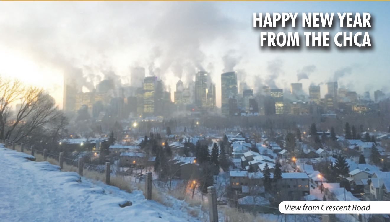
View from Crescent Road