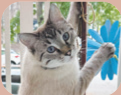
Chigs, Crescent Heights