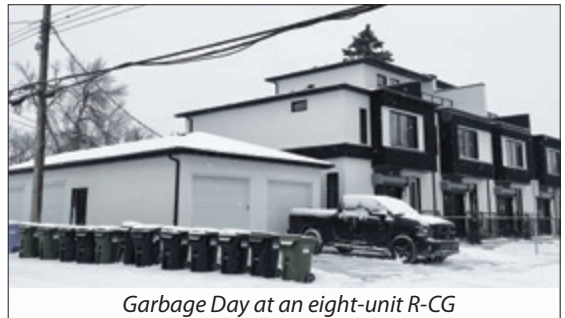
Garbage Day at an eight-unit R-CG

Densification comes with pluses and minuses. Though we live in a walkable neighbourhood, most Calgarians have at least one vehicle per household (not half a vehicle). This means our streets will have to accommodate more residential parking. Increased lot coverage will mean less permeable land, fewer trees due to private tree removal, and a reduction in sunlight and privacy for neighbouring lots. Permeable land is land that is not developed and serves as a sponge for our groundwater, while offering places to plant trees, shrubs, and groundcover. The City argues it is about quality of plantings, not quantity. Quality can be asked for at the time of construction, but there is no guarantee it will be maintained. As any gardener will tell you, light is perhaps the most important element for success. Will these narrow, light starved spaces be able to perform? Our urban forest will be impacted and our critical infrastructure, essential to climate, biodiversity, and our well-being.