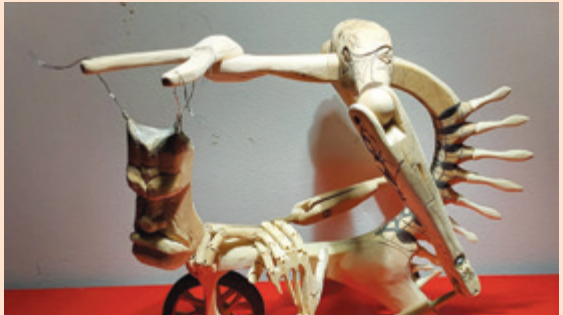
Lyle Pizio's stop-motion animation uses handmade wooden puppets held together with bits of recycled bicycle tires and fishing line.