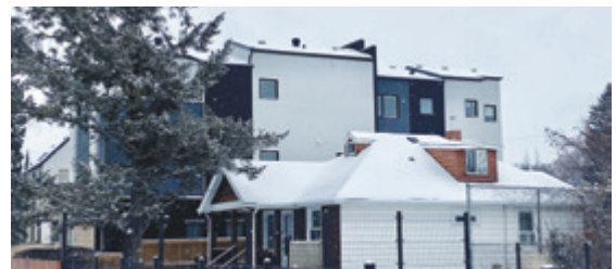
Scale difference between R-CG and a heritage home

What does this mean? It means that the potential new home(s) next to you will be taller than yours, it will cover more of the lot area (so less green area or trees), and will offer only half the onsite parking.