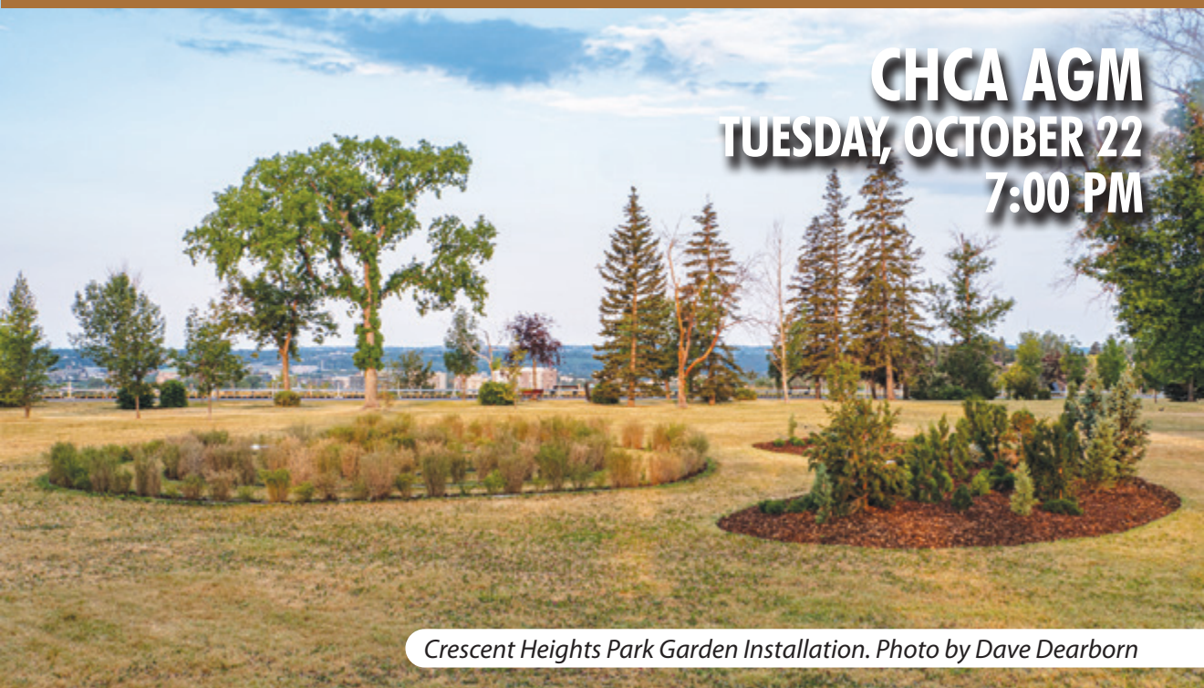
Crescent Heights Park Garden Installation.