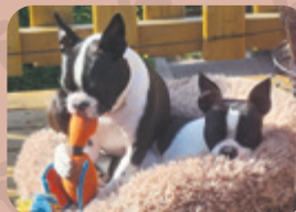
Thor and Loki, Shawnessy