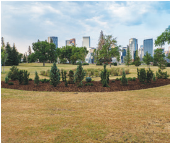
Crescent Heights Park Garden Installation