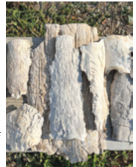
Beetle Gallery by Julya Hajnoczky

Julya Hajnoczky's work is a critical examination of human impacts on the natural world and how ecosystems are changing in our current era. Adopting and adapting the practices of scientific investigators, her multidisciplinary practice involves collecting materials following ethical foraging practices (plants, bones, or lichen specimens, for example) from natural environments, for use as raw material in making work, and as reference material. She investigates ecosystems and the connections within them, particularly via site visits and consultation with scientists and other experts and she is continually seeking out new ways of exploring themes of biodiversity loss and climate change, to translate expert knowledge into accessible, intriguing, relevant, and impactful artwork.