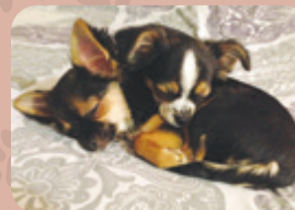
Tiger and Lily, Evanston

To have your pet featured, email news@mycalgary.com