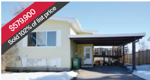
$579,900 Sold 102% of list price Southwood Bungalow