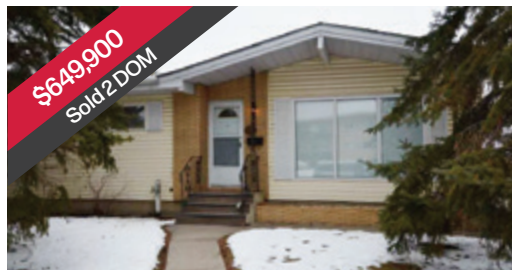
$649,900 Sold 2 DOM 3016 Blakiston Drive