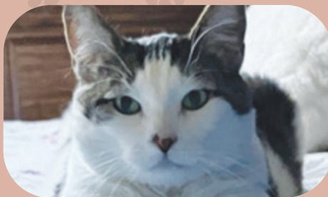
Starr, Lake Chaparral