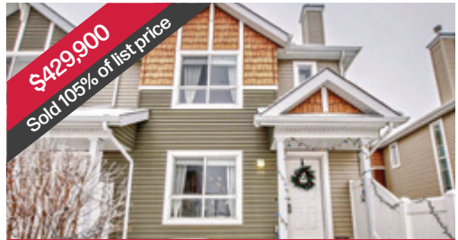
$429,900 Sold 105% of list price Tuscany Townhouse