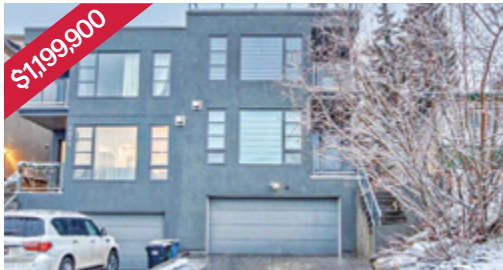
$1,199,900 Infill in the heart of South Calgary