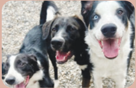
Bowser, Remus, Riku, Montgomery