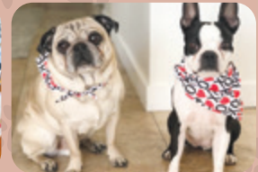
Talbot and Scout, Queensland

To have your pet featured, email news@mycalgary.com