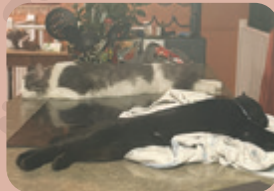
Flair and Little Lady, Strathcona Park