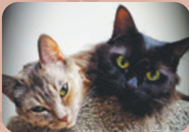
Ash and Bella, Cranston