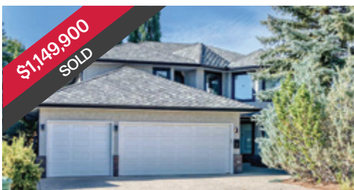
Banff Trail Renovated Bungalow