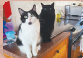
Meatball and Cleo, Renfrew