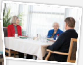
Daily dining in the company of new friends

Availability for certain floor plans is becoming limited. Don't miss out! Call now for the best selection of private suites.