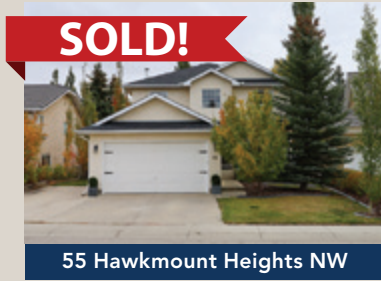
55 Hawkmount Heights NW Updated 5 Bdrm + Den $799,900