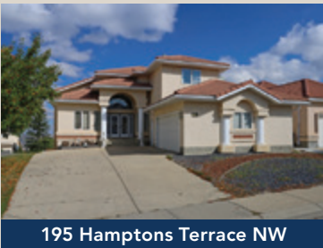
195 Hamptons Terrace NW 5 Bdrm + Den, on Golf Course $1,250,000