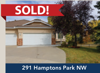
291 Hamptons Park NW Renovated Villa, Backs on Park $749,900

Sell your home quickly for asking price, possibly above!!