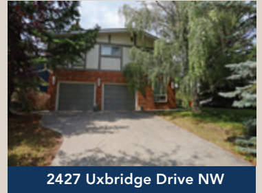
2427 Uxbridge Drive NW 5 Bdrm + Den, Backs on Park $1,200,000