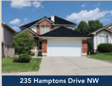
235 Hamptons Drive NW 3 Bdrm + Den, with Walkout $849,900