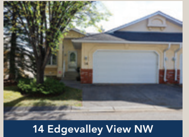
14 Edgevalley View NW 2 Bdrm + Den, Villa on Ravine $899,900

3D tours, detailed floor plans, plus much more with our proven marketing and state-of-the-art technology. Call for your free home evaluation today!