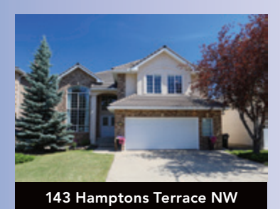
5 Bdrms + Den, on Golf Course $1,289,900