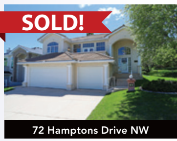
Mint 3 Bdrms, 3-Car Garage $899,900