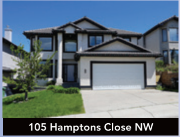
5 Bdrms, Finished Walkout $1,249,900