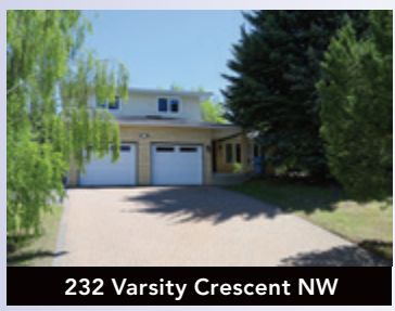
Updated 5 Bdrms, Fully Finished $1,099,900