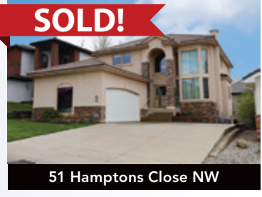
6 Bdrms, Finished Walkout $1,279,900

3D tours, detailed floor plans, plus much more with our proven marketing and state-of-the-art technology. Call for your <u>free home evaluation</u> today!