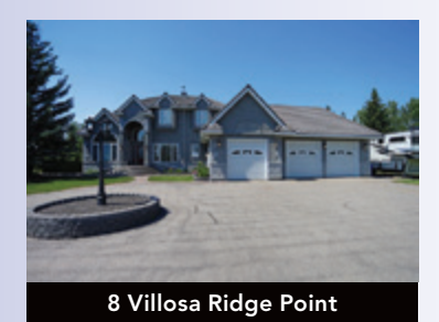
5 Bdrms + Den, 3-Car Garage $1,789,900