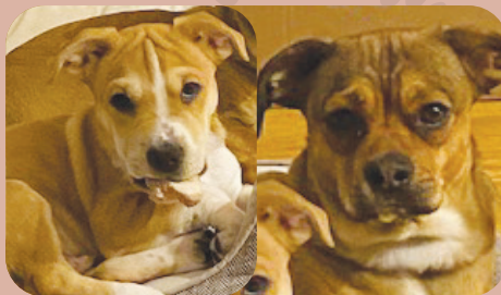
Tucker and Bentley, McKenzie Towne

To have your pet featured, email news@mycalgary.com