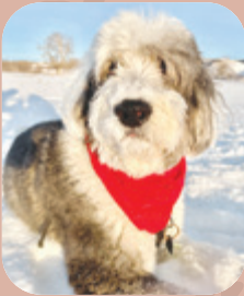
Poupie, Deer Run