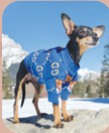
Mirabella, Lower Mount Royal