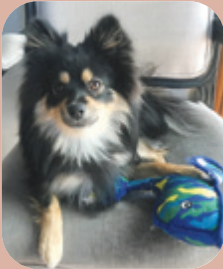
Lizzy, Huntington Hills