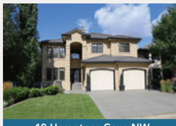
10 Hamptons Cove NW 4 Bdrms, Walkout on Golf Course $1,988,000