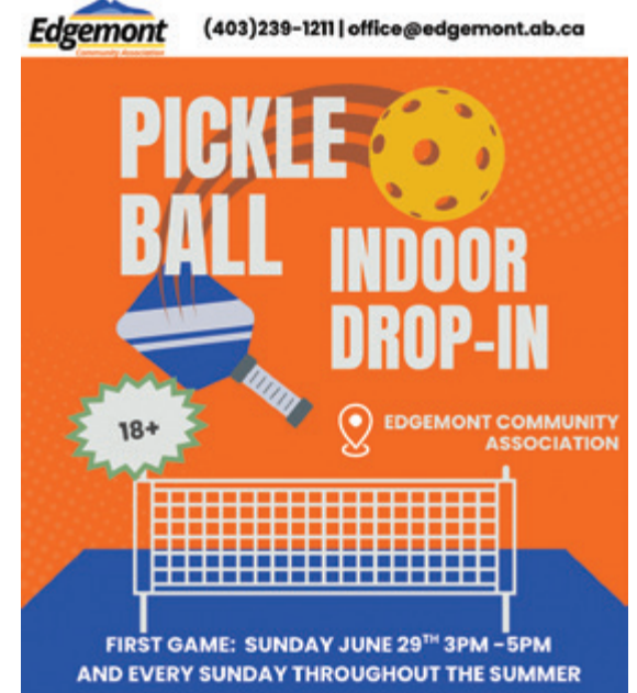
403/239-1211 office aedgemont.ab.ca

Come join us, bring your paddles and come!!!!