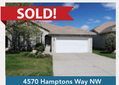
3 Bdrms, Walkout on Golf Course $1,199,000

Contact Us Today and Let Our Experience Work for You!