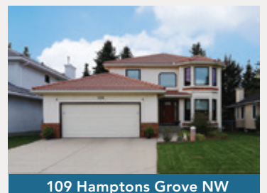
4 Bdrms + Den, South Backyard $919,900