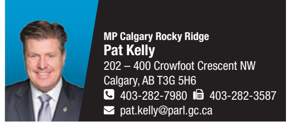
MP Calgary Rocky Ridge Pat Kelly 202 – 400 Crowfoot Crescent NW Calgary, AB T3G 5H6 ☎ 403-282-7980 📠 403-282-3587 ✉ pat.kelly@parl.gc.ca

December 1, 2023, all photo radar sites were removed from ring roads in both Calgary and Edmonton and moved to school, playground, and construction zones to improve safety and protect those in vulnerable situations. Transportation and Economic Corridors and Public Safety and Emergency Services will engage with municipalities and law enforcement over the next year to get rid of all “fishing hole” locations so Albertans are assured that photo radar is focused on traffic safety.