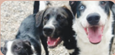
Bowser, Remus, Riku, Montgomery