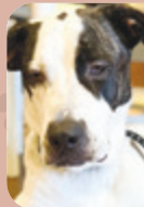
Teddy and Sassy, Foothills