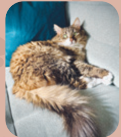
Guzel, Huntersen Place