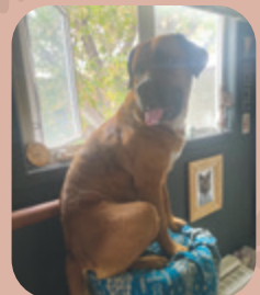
Poppy, Tuxedo Park