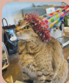
Sugar, Signal Hill