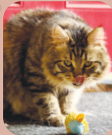
Dobby, Huntersen Place