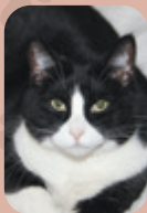
May, Elbow Park