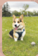
Moony, Lake Bonavista