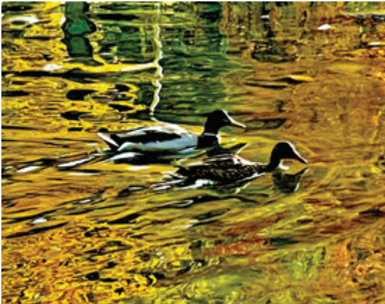
Ducks in a row

Thanks to Ray W. for submitting this stunning photo of the Northern Lights captured on 3 Ave NW.