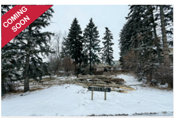
1221 17A Street NW

Explore one of many land opportunities coming soon in West Hillhurst & Hounsfield Heights/Briar Hill!