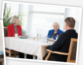
Daily dining in the company of new friends

Availability for certain floor plans is becoming limited. Don't miss out! Call now for the best selection of private suites.