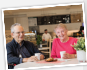
Treat yourself at the Bistro