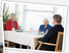
Daily dining in the company of new friends

Availability for certain floor plans is becoming limited. Don't miss out! Call now for the best selection of private suites.