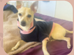
Sparky, Douglas Glen

To have your pet featured, email news@mycalgary.com