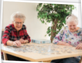
Enjoy an active social life