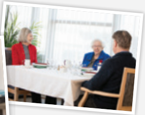
Daily dining in the company of new friends

Availability for certain floor plans is becoming limited. Don't miss out! Call now for the best selection of private suites.