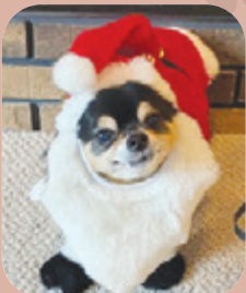
Pedro, Sandstone Valley