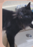
Sergeant Pepper, Thorcliffe