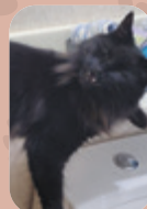
Sergeant Pepper, Thornclyffe