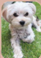
Archie, Sage Hill