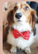
Toby, Patterson Heights

To have your pet featured, email news@mycalgary.com