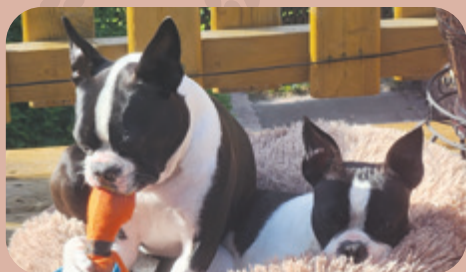
Thor and Loki, Shawnessy