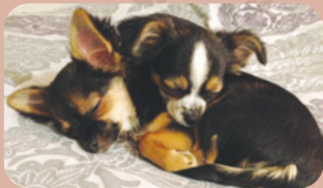
Tiger and Lily, Evanston

To have your pet featured, email news@mycalgary.com