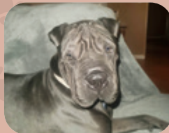
Rigby, Huntington Hills