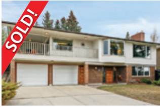
311 SILVER VALLEY BLVD NW