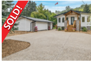
8019 33 AVENUE NW