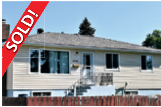
6364 33 AVENUE NW