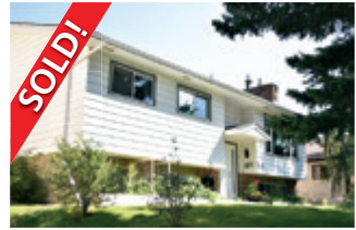
8408 62 AVENUE NW