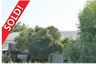
3416 BOWMANTEN PLACE NW