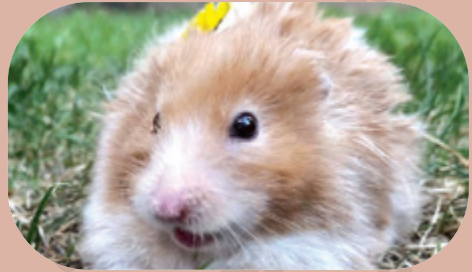
Biscuit, Deer Run