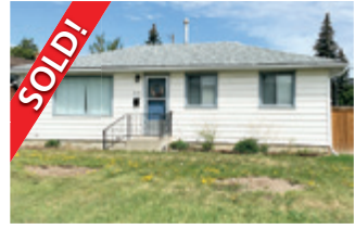
6312 33 AVENUE NW