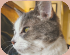
Squeeks, Mount Pleasant