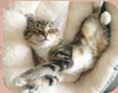
Ravioli, Lower Mount Royal