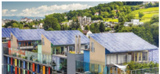
"Residences in the Sun Ship." Green City Times, October 30, 2023