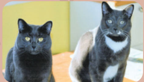
Sir Gawain and Sir Tristan, Woodbine

To have your pet featured, email news@mycalgary.com