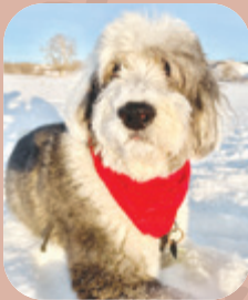
Poupie, Deer Run