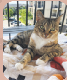
Willow, McKenzie Towne

To have your pet featured, email news@mycalgary.com