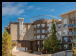
218, 88 Arbour Lake Road SOLD