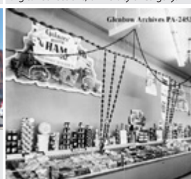
https://digitalcollections.ucalgary.ca/asset-management/2R3BF1SKDB98?WS=SearchResults . "Jenkins' Groceteria No. 7, Calgary, Alberta," [ca. 1955], (CU1207905) by Rosettis Studio. Courtesy of Glenbow Library and Archives Collection, Libraries and Cultural Resources Digital Collections, University of Calgary.