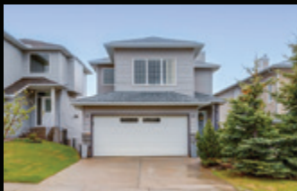
122 Royal Birch Rise $724,900