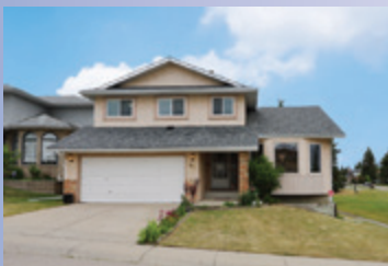
93 Hawkdale Circle NW

Lovely 4 Bdrms, Backs on Greenbelt $649,900