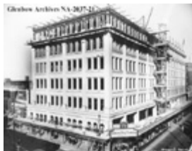
https://digitalcollections.ucalgary.ca/asset-management/2R3BF1003VF0?WS=SearchResults. "Addition to Hudson's Bay Company store, Calgary, Alberta," 1929-10-07, (CU190410)

*All copyright images cannot be shared without prior permission.