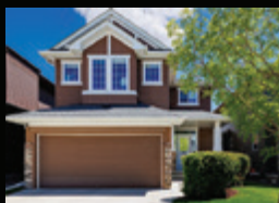
215 Evansfield Way SOLD