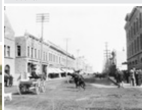
https://digitalcollections.ucalgary.ca/asset-management/2R3BF1F3UXYA?WS=SearchResults. "Stephen Avenue looking east from 134 - 8th Avenue SW, Calgary, Alberta," [ca. 1897-1899], (CU1126014)