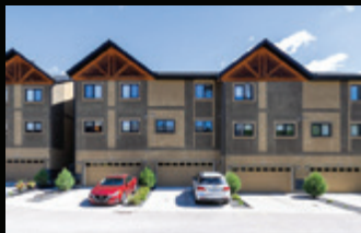
307 Valley Ridge Rise $639,900