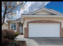
15 Hamptons Bay SOLD