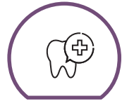
TOOTH COLOURED FILLINGS