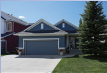
91 Evanspark Terrace NW

Sell your home quickly for asking price, possibly above!!