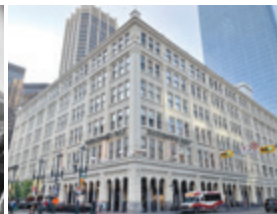
Hudson's Bay Company building, corner of 1 St SW and 8 Ave, 2019.