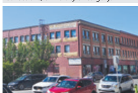
The Reliance (Armour) Block, an Edwardian commercial-style building constructed in 1909-1912, former site of Wiggins Hall, June 2024.