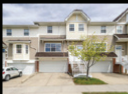
256 Tuscany Springs Blvd SOLD