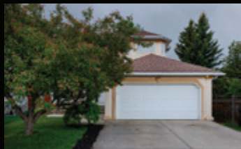
38 Valley Glen Heights $825,000