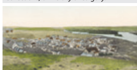
https://digitalcollections.ucalgary.ca/asset-management/2R3BF1SR7651?WS=SearchResults . "View of Calgary, Riverside district, Calgary, Alberta," [ca. 1908], (CU1197128) by Unknown. Courtesy of Glenbow Library and Archives Collection, Libraries and Cultural Resources Digital Collections, University of Calgary.