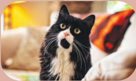
Tuxedo Joe, Cranston

To have your pet featured, email news@mycalgary.com