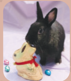
Peanut, Signal Hill