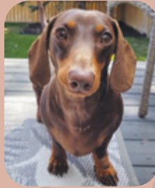
Chestnut, Canyon Meadows